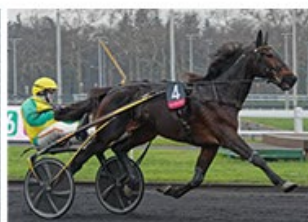
VIVID WISE AS